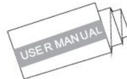
User Manual x1