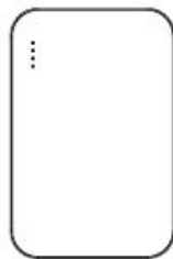
Power Bank x1